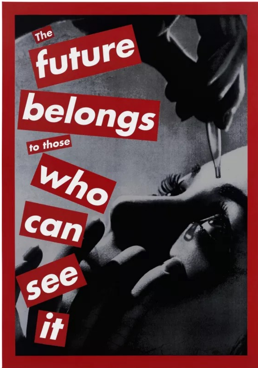
Barbara Kruger Untitled (The future belongs to those who can see it), 1997 Silkscreen on vinyl 85 × 60 in 215.9 × 152.4 cm