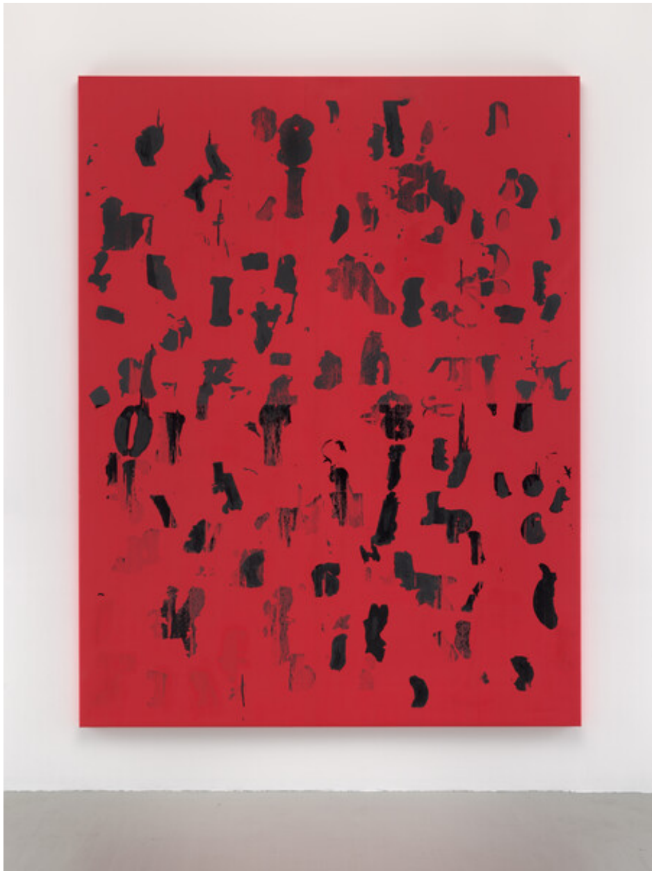
Glenn Ligon Debris Field (Red) #14 2021