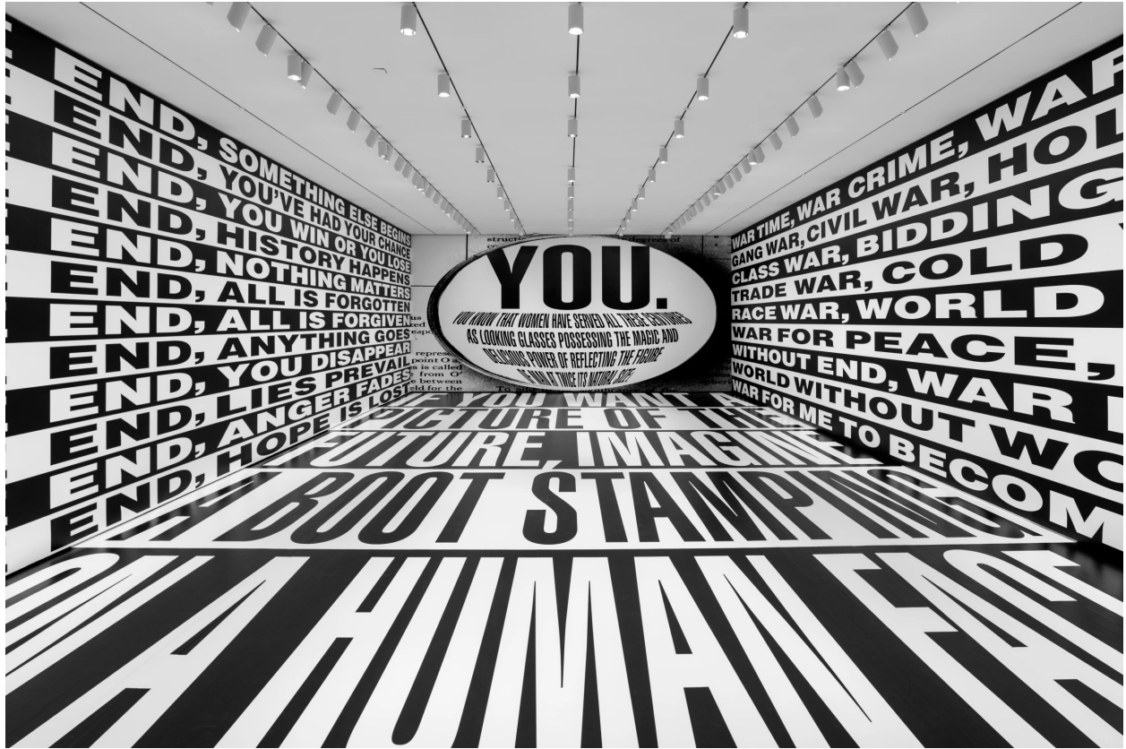
Barbara Kruger's installation of "Untitled (Forever)," 2017, swallows an entire gallery at LACMA.